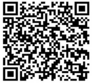
Scan to Pay through UPI